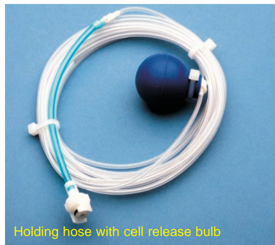
Holding hose with cell release bulb