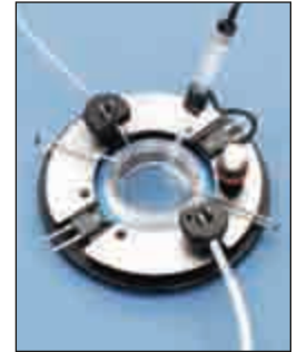
ABR-1 Shown mounted to a QE-1 Heated Base