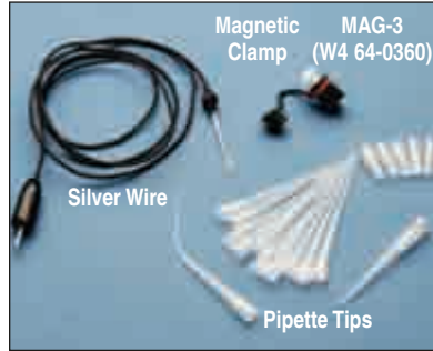
ABR-1 Kit Components

Developed for use in low volume recording chambers. The ABR-1 Agar Bridge Reference Electrode Kit consists of a 1 mm diameter silver wire electrode mounted in a modified pipette tip that can be filled with a 3 M KCl agar mixture. An included magnetic clamp with flexible holder for the pipette tip is perfect for positioning the electrode at any angle in the chamber. In addition, the pipette tips can be cut to length or shaped using a heat gun. The silver wire electrode comes with 1 meter of flexible wire terminated in a 2 mm pin. Includes a 2 mm to 1 mm pin adapter for use with 1 mm jacks.