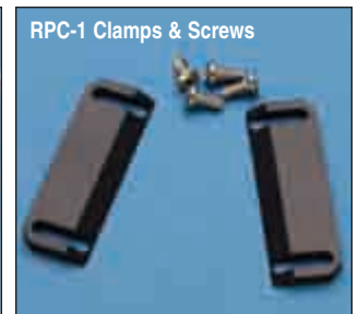
RPC-1 Clamps & Screws