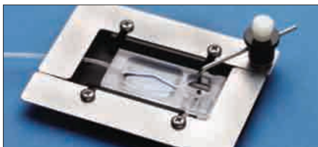
Suction tube holder