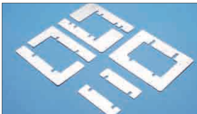
Each kit comes with four complete base plate designs, offering considerable versatility.