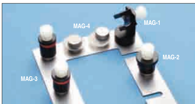
Magnets with just the right amount of force are used in the clamp kit