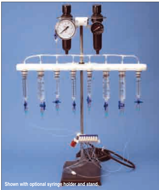
Shown with optional syringe holder and stand.